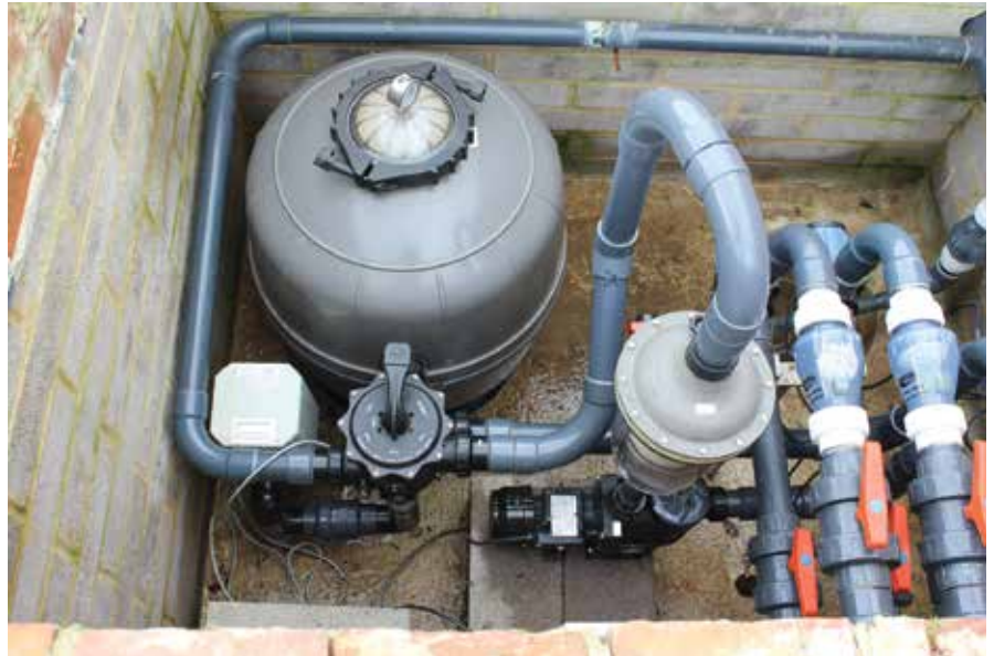
▲ Exotuf Pond Professional Bead filters are designed for ponds and water gardens. It provides mechanical and biological filtration in a compact single vessel.

This Waterco equipment works well in conjunction with the gravel bed filtration already built around the pool edges. This sort of filtration is also known as 'regeneration zone', and is an effective method through which natural pools are kept clean and free from threats from algae invasion.