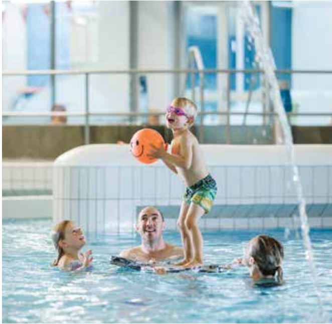
The upgraded commercial pool filtration equipment not only provides ultra-fine filtration for a safer pool and spa environment, but also reduces expenses associated with backwash, electricity, chemicals, and maintenance.