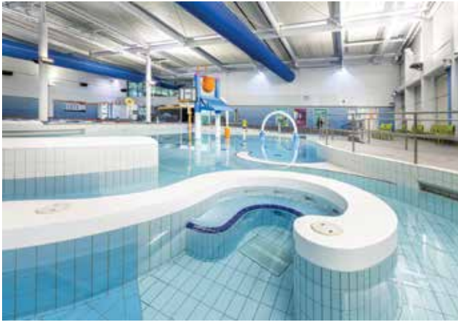
Pioneer Recreation and Sport Centre in New Zealand are relying on new technologies to cut operational costs while helping people stay fit and water safe.