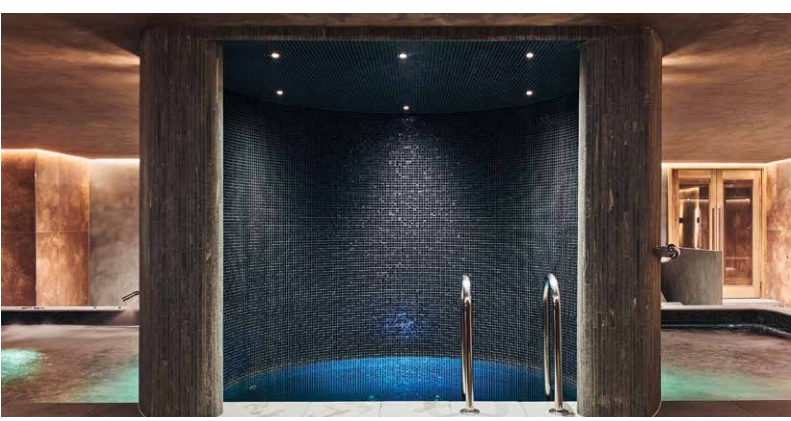
Designed for recovery, the facility's 6.3m³ Cold Plunge Pool allows members to complement their fitness routines with the benefits of cold water immersion.

"The project included the swimming pool, hydrotherapy pool, cold plunge pool, steam rooms, Loyly sauna, Finnish sauna, and luxury finishes, to name a few," says Fisher.