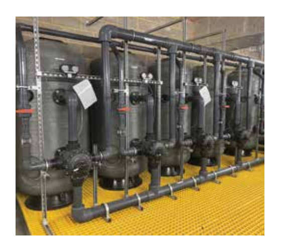
The 25m metre, 240 m³ swimming pool relies on Waterco's proprietary fibreglass filters, Hydrostar commercial-grade pumps, and water-saving MultiCyclone centrifugal filters to maintain premium water quality.