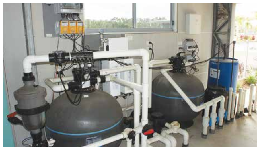
▲ The Hydroxypure system continually sanitises your swimming pool by testing the water and automatically maintaining optimum levels of residual sanitiser.

“Our specially-made control unit maintains adequate levels of hydrogen peroxide to be retained within the swimming pool, automatically adjusting its dosing for high bathing loads, hot weather, rain and pool top ups,” says Nick Briscoe.