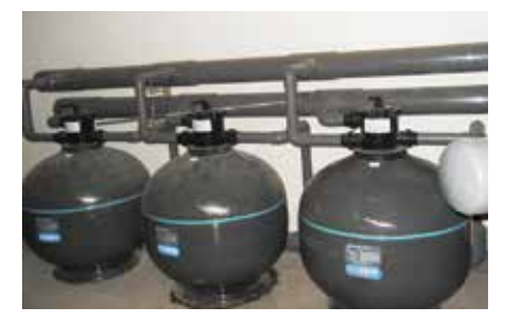
For filtration, three Micron S900 top mount fibreglass filters were installed, in addition to three Hydrostorm Plus 4HP (3-phase), variable speed pumps.

"When a water sample was taken and independently tested by the national water supply monitor to check it adhered to the national drinking water sanitary standard, the result was very convincing. In fact, the turbidity (measure of the cloudiness of water) was less than 0.5, plus no E. Coli was detected," says Mr Yap.