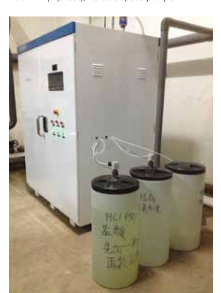
The Hydroxypure system continually sanitises your swimming pool by testing the water and automatically maintaining optimum levels of residual sanitiser. The pH level of your pool's water is also automatically adjusted, ensuring optimum water quality and protecting you and your pool from unhealthy swimming conditions.