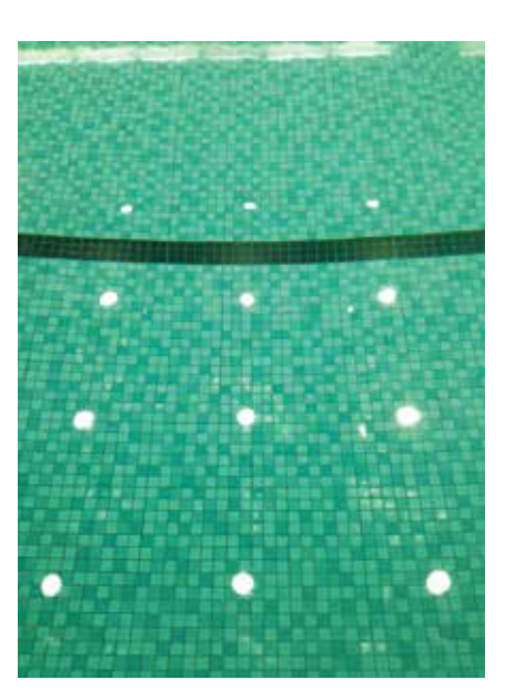
The use of ozone and Perox in harmony increases active oxygen levels in the water. This synergy ensures the safety of your water environment without creating harmful chemical by-products.

Another highlight of the DIGICHEM PLUS+ system is that minimal maintenance is required.